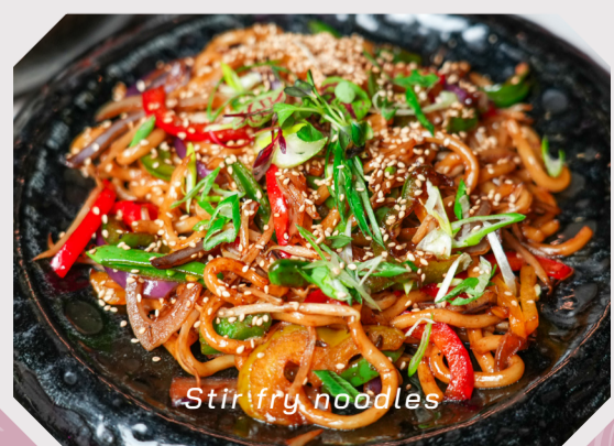
Stir fry noodles