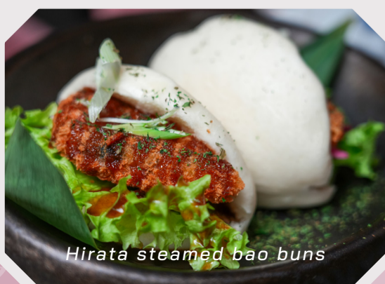
Hirata steamed bao buns